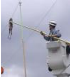
'Deer with wings' causes power outage in Montana Weather and Sports 4 weeks ago