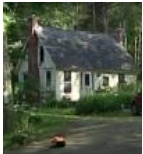
Popular teacher burned to death 2 weeks ago