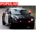
POPULAR Westland - New trick allows any Michigan resident to get extremely cheap car insurance.