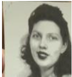
Missing woman found alive after 40 years 2 weeks ago