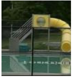
Woman's body in public pool for days 3 weeks ago