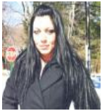
Vernon police searching for missing woman 1 day ago