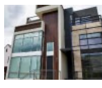
Homeowners in Michigan may be eligible for 3% refinance rate with any credit type.