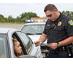
Michigan: Mom discovers $9 car insurance trick. Auto insurers are scared you will learn this too.