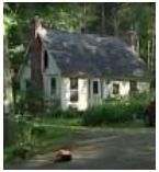
Popular teacher burned to death 2 weeks ago