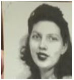
Missing woman found alive after 40 years 2 weeks ago