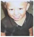
Toddler died after drinking gasoline 2 weeks ago