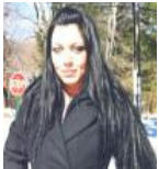
Vernon police searching for missing woman 1 day ago