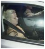
Truck driver stops kidnapping 2 weeks ago