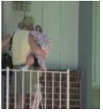
Parents charged after pet ferret eats baby's fingers and Sports 6/16/2011