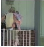
Parents charged after pet ferret eats baby's fingers and Sports 6/16/2011