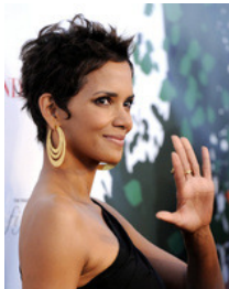
Halle Berry click image to enlarge