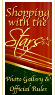
Photo Gallery & Official Rules