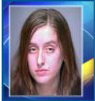
Woman accused of stealing donations for fallen officer 1 day ago