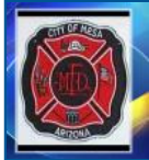
Crushed bulbs found in barrels at Mesa hospital 1 day ago