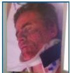
Attorney: Wal-Mart shopper victim of excessive force 2 days ago