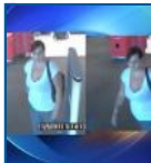
Credit cards stolen from vehicle, charged at store in Scottsdale 2 weeks ago