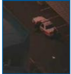
Police: Scottsdale man shoots, kills roommate New Today!