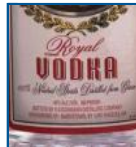
Teens using vodka tampons to get drunk 3 weeks ago