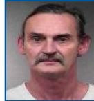
Driver charged with 'super extreme DUI' after losing keys 1 day ago