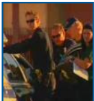
Police: Phoenix mom kills backyard intruder 3 days ago