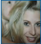
Cold Case: Portland woman's body found near waterfall 1 day ago