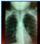
Pot hole saves girl's life 3 weeks ago