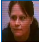
Convicted killer set to be released from prison 1 day ago