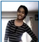
Portland police find missing 13-year-old girl 2 weeks ago