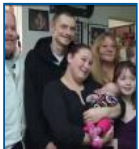
New mother: 'I didn't know I was pregnant' 3 days ago