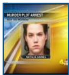
Woman arrested in murder-for-hire plot 1 day ago