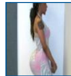
Women uses "Fix a Fiat" for butt injections 2 weeks ago