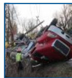
Truck overturns in Wilson County; driver hurt 2 days ago