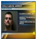
Murfreesboro man accused of trying to break infant's neck 4 days ago