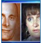
Rare insight into mysterious 'Most Wanted' fugitive 9/21/2011