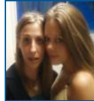
Female soldier missing after first day in basic 10/20/2011