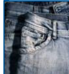
How to wear jeans almost anywhere