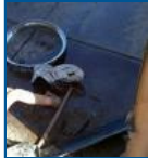
Police: Woman hit at bus stop, driver in custody 2 weeks ago