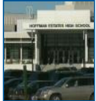
High school teacher caught living with student 3 days ago