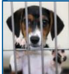
Amazing stories of lost and found dogs