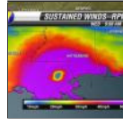
Hurricane Isaac: Everything you need to know right now 1 day ago