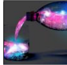
Glowing Aurora Jungle Juice Lights Up the Party 2 weeks ago