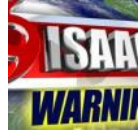
MEMA updates state actions in response to Isaac New Today!