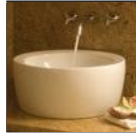
Four Seasons Lands in Orlando 03/21/2012